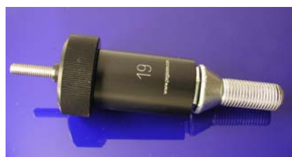
19mm Clamp Holder with Sleeve and Quick Fastener on a wheel bolt

The Clamps main property is its high holding force. It allows attachment of heavy equipment securely to the wheel nuts, even on very bad roads.