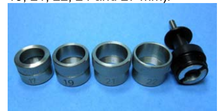
Magnetic holder shown with guide caps for 17, 19, 21, 22mm

The Magnetic Holders is a new proprietary and registered design. They are for quick and ease of connect/disconnect of the measuring equipment. The Magnetic Holders are ideal for series test of tires where frequent and quick changes are required. They offer a clear cost advantage due to their interchangeable Guide Caps and magnetic core element. Various cap sizes allow the use of one magnetic core element for different wrench sizes (e.g. 15, 17, 19, 21, 22, 24 and 27 mm).