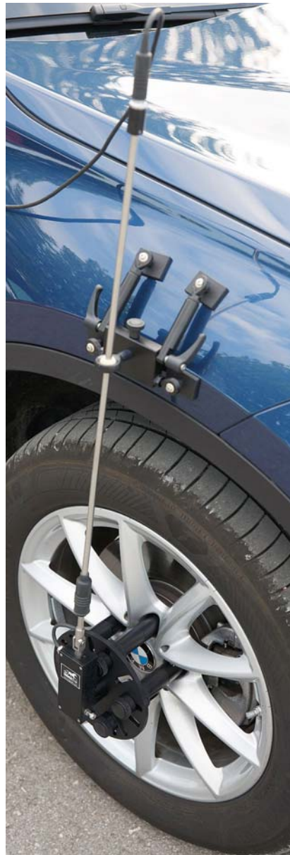
Modular Mounting System (MMS) and Wheel Speed Sensor (WSS) on the front wheel

Two different bolt variants are available for this system, Hexagonal Clamps (collects) or Magnetic Holders. Both are suitable for general use, each with special advantages in different applications.